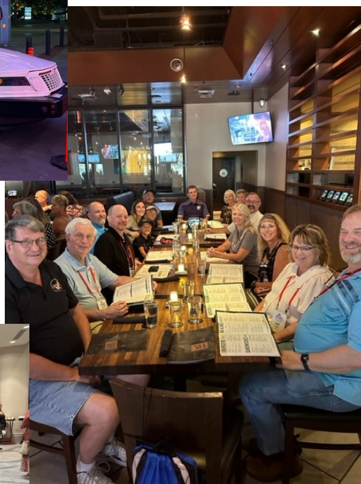
State of IA dinner