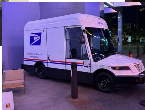
New Delivery Vehicle