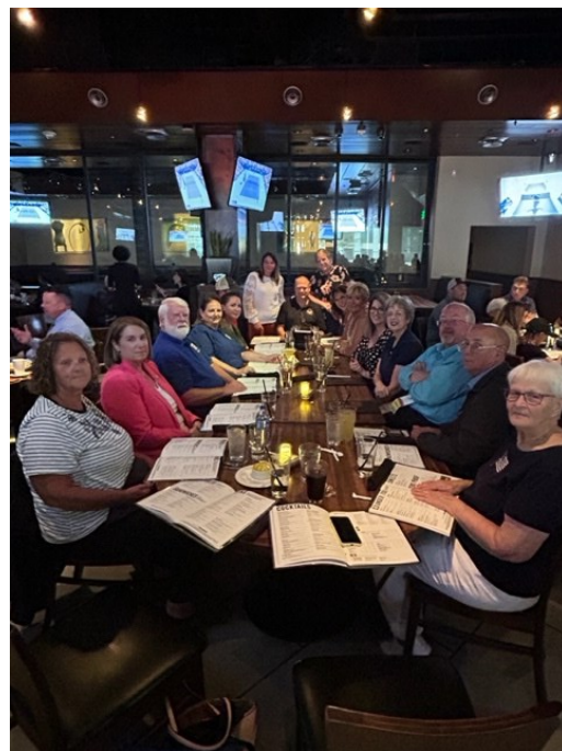
State of IA for dinner