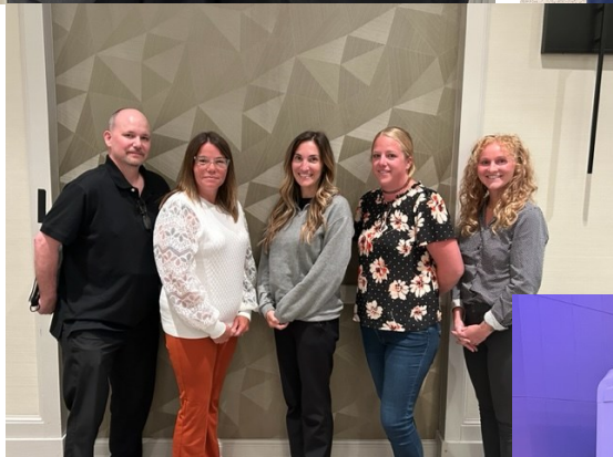
State of IA First Timers