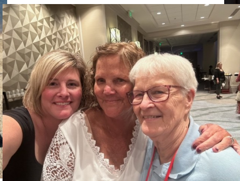
The Hawkeye Heartlander