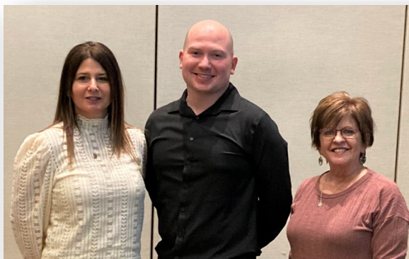
Louisiana UPMA Board members in attendance at the national Membership Training

ready investing your money and now I want to ask you for your time. The Louisiana Chapter of UPMA provides three annual meetings, one in January/ February, State